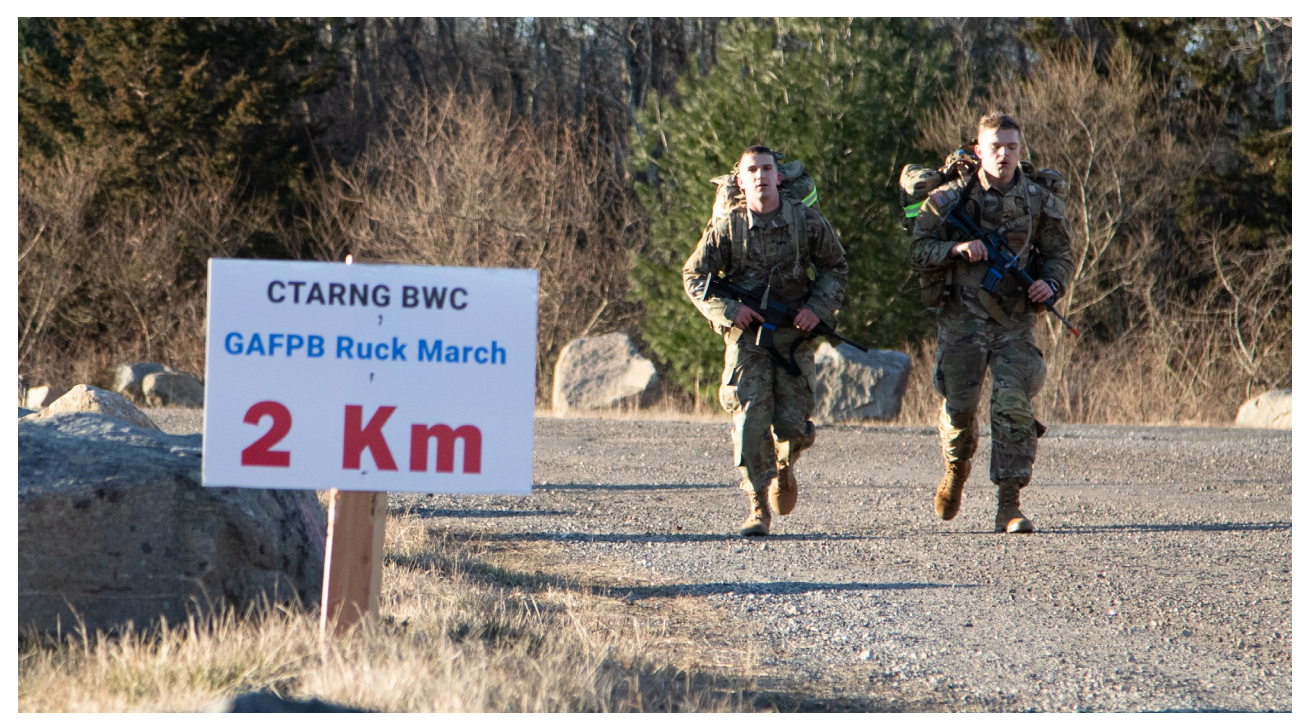
Contestants participating in the 2024 Connecticut Army National Guard Best Warrior Competition work toward completing the German Armed Forces Proficiency Badge.

Day two picks up in intensity, starting the day with the swimming event for the GAFPB. For this event, the competitors must swim 100 meters in under for minutes