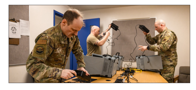
103rd tests battle management system of the future Page 3