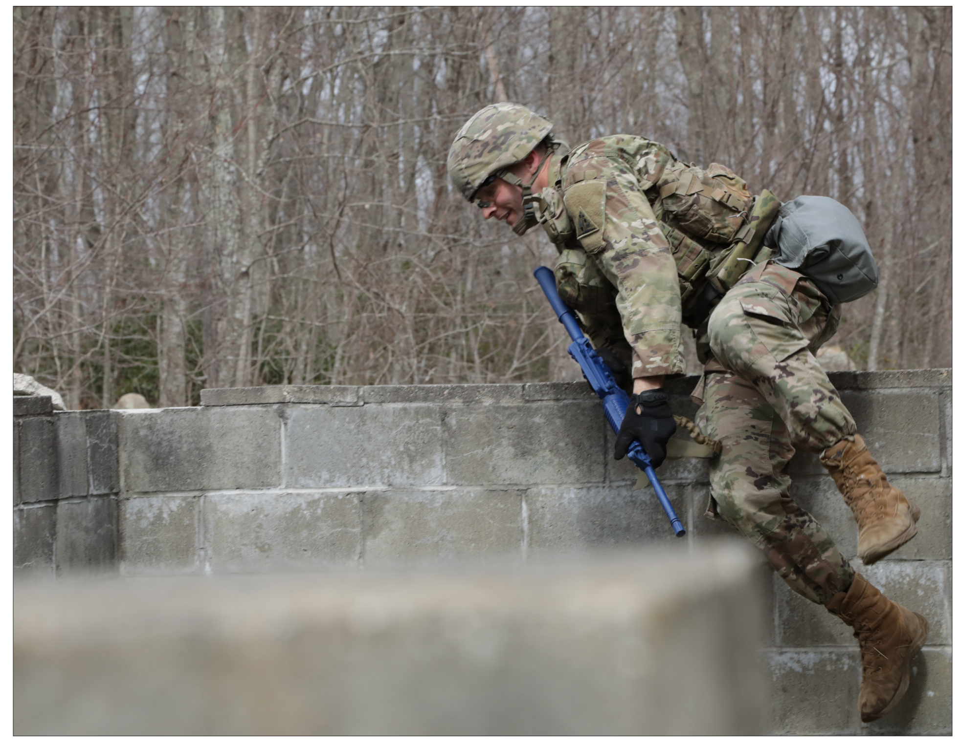
A contestant in the 2024 Connecticut Army National Guard Best Warrior Competition climbs over a wall during as part of the competition. The winners of this competition will go on to represent Connecticut in the regional competition.