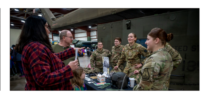
Guardsmen participate in 'Women Take Flight' event Page 19