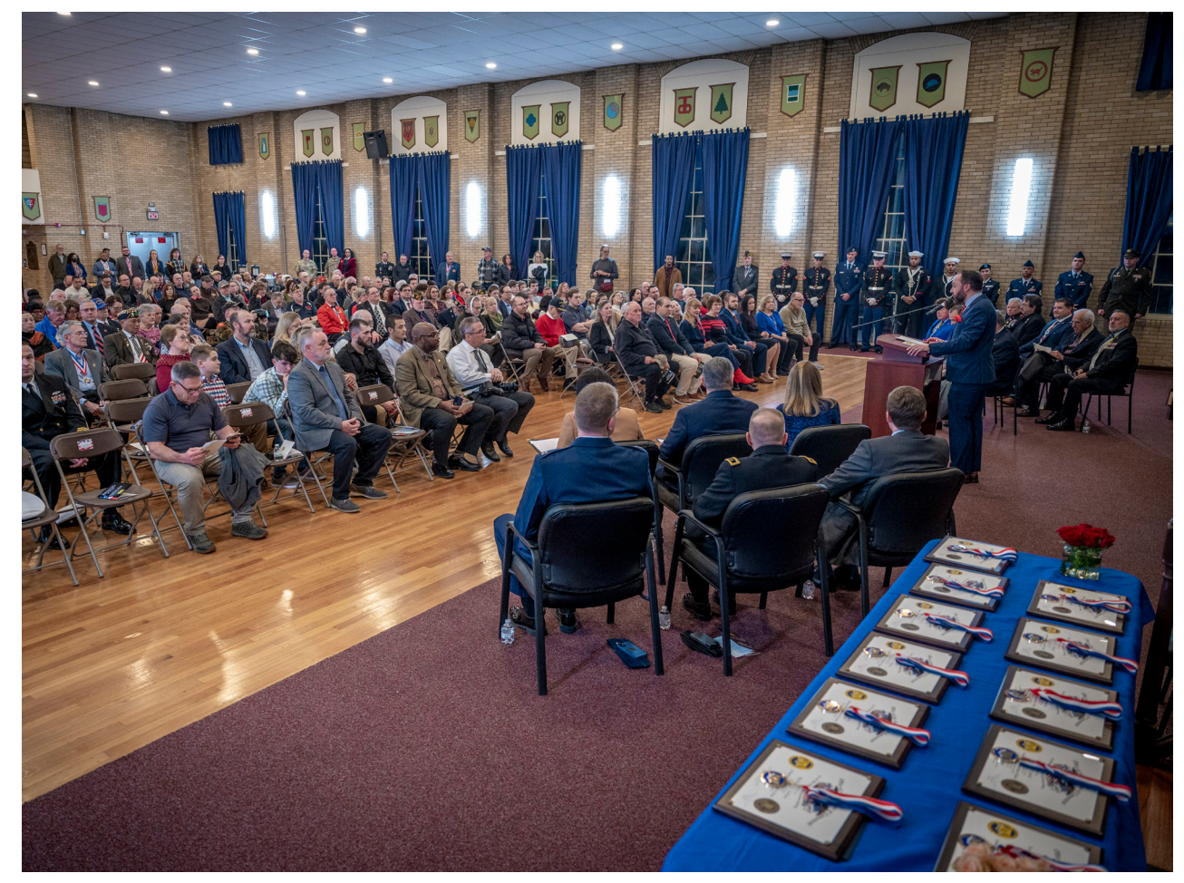
Twelve Connecticut veterans listen to guest speakers during a ceremony where they were inducted into the state's veterans hall of fame for their contributions to the veteran community during and following their time in service at the Department of Veterans Affairs in Rocky Hill, Connecticut, Jan. 25, 2024.